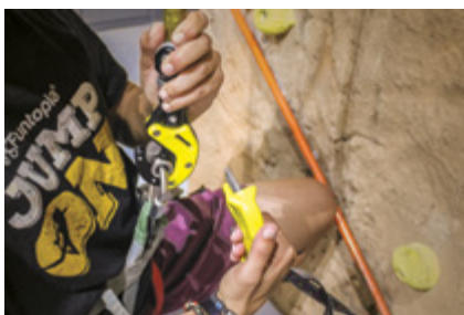
1 Insert the Self Belay key in the device all the way in.