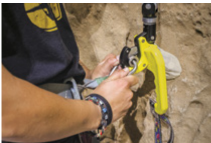
1 Insert the Harness Piece in the Self Belay all the way down until it clicks.