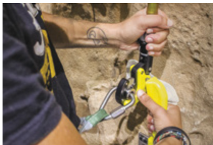
2 Take away the Self Belay key.