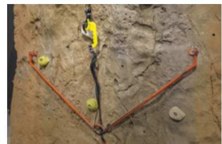
3 You are now disconnected from the Self Belay and may move to another auto belay