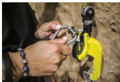
2 Remove the Harness Piece from the device gate.